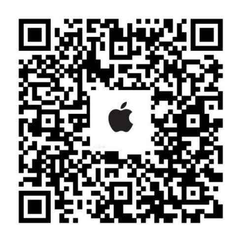
Apple download locations

• For the first time to enter the APP, need to scan the following two-